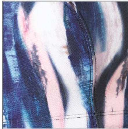
Abstract Desert Landscape Print