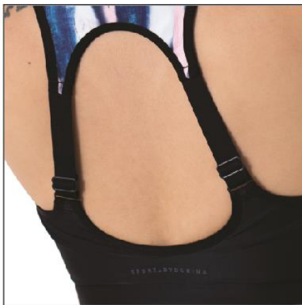
New Brand Logo