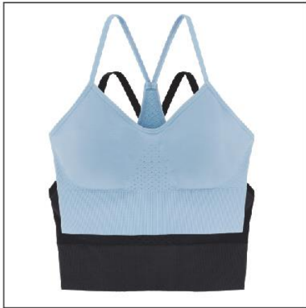
2PP Recycled Circular Knit