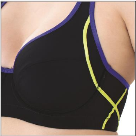
Contrast Colour Elastics