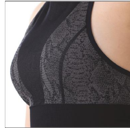
Seamless Snake Pattern