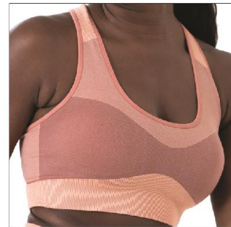
Seamless Colour Blocking