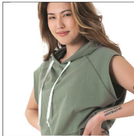
Organic Cotton French Terry