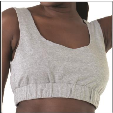
Grey Melange Organic Cotton