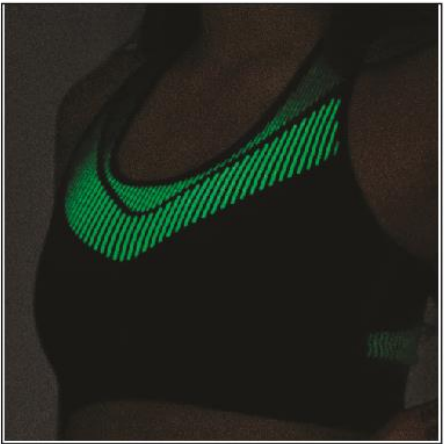
Reflective Yarn Glow in The Dark